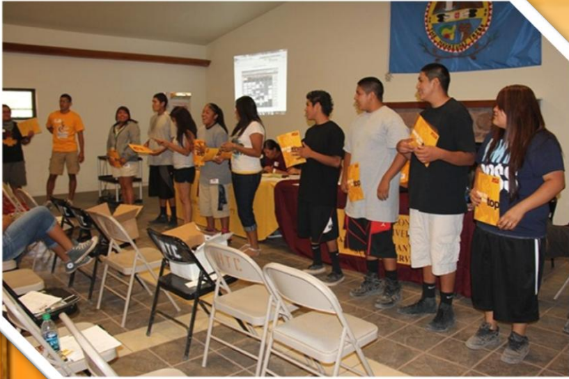
Step to the Top