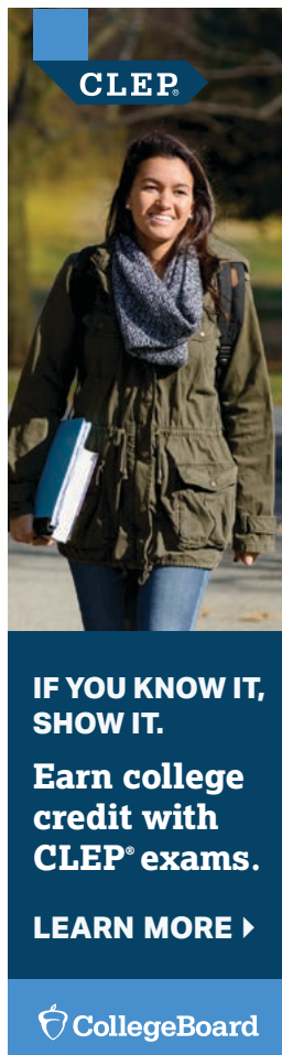
Banner #2: 160x600