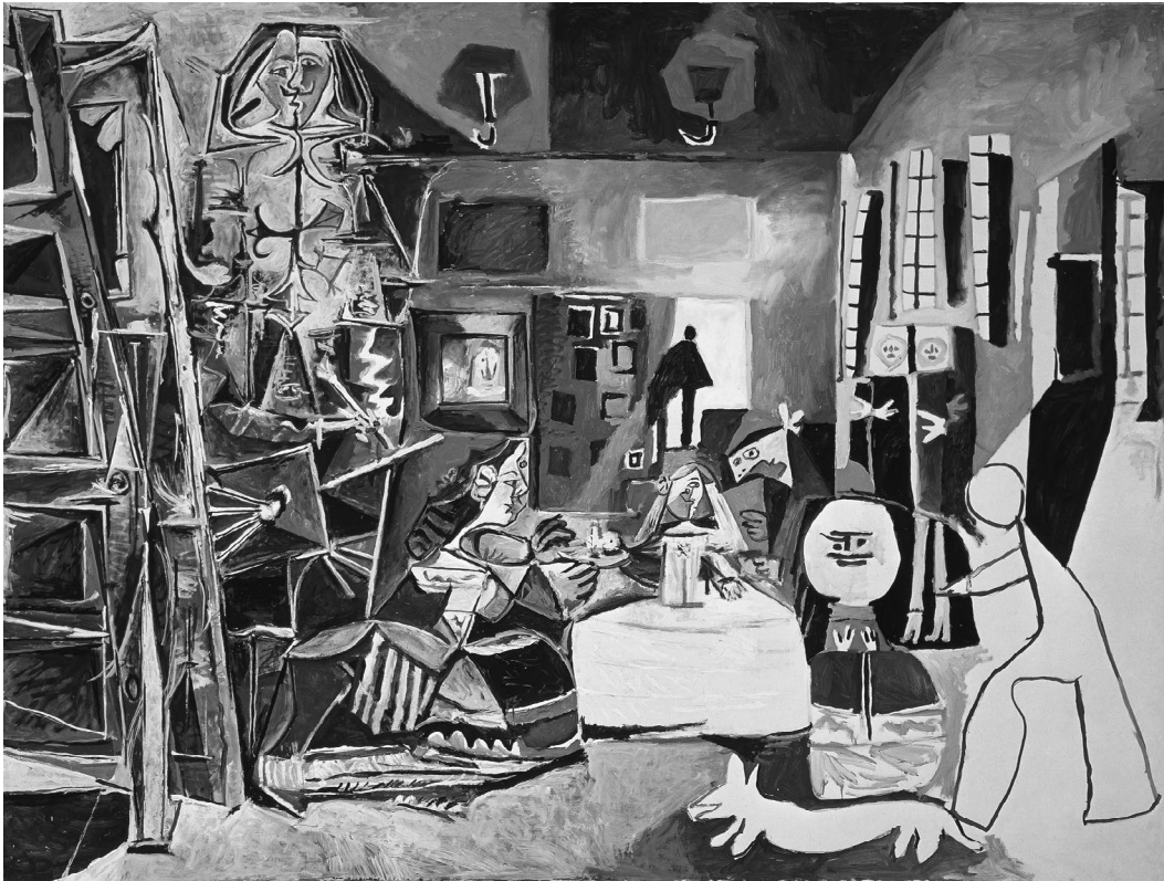
Bridgeman Images © 2014 Estate of Pablo Picasso/Artists Rights Society (ARS), New York