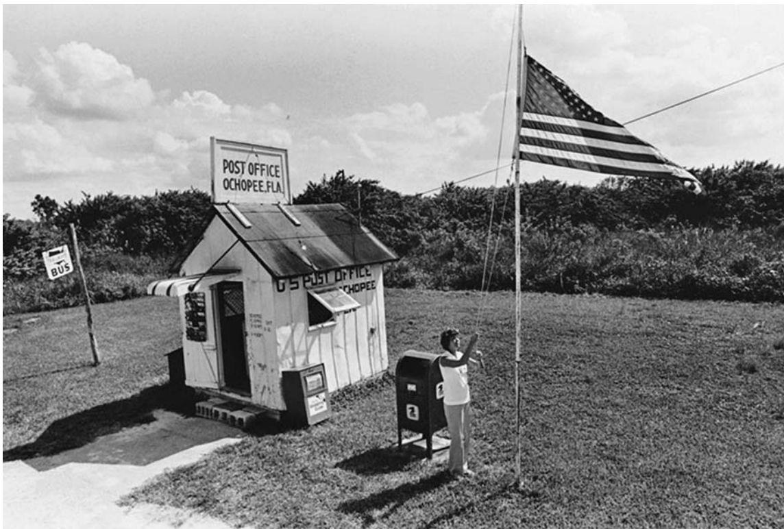
Ochopee Post Office, Florida, 1970s

The following photo, from the Web site of the United States Postal Service, shows the Ochopee Post Office, the smallest free-standing post office in the United States.