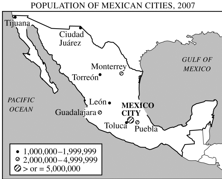
MEXICO'S MOST POPULOUS CITIES