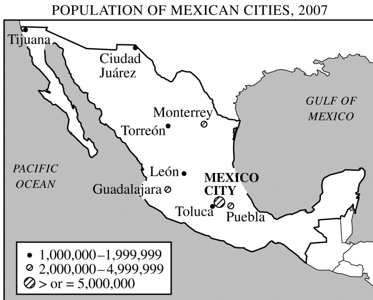
MEXICO'S MOST POPULOUS CITIES