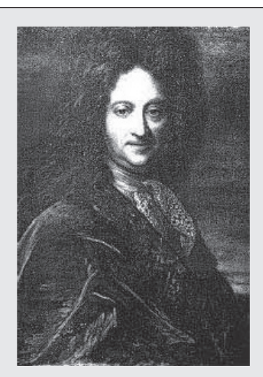
Portrait of Pierre Le Pesant Sieur de Boisguilbert

This document addresses the effects of taxation on the people.