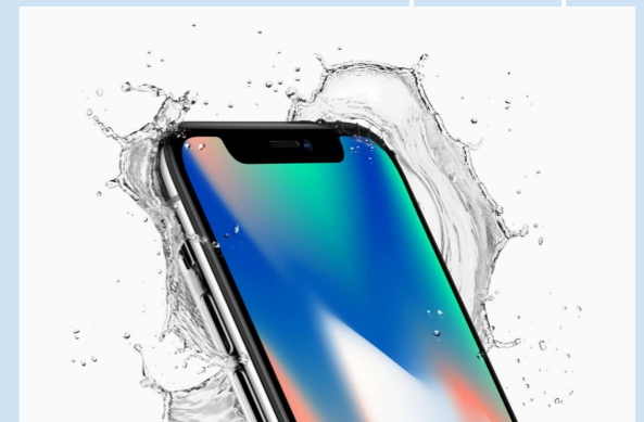
WATER AND DUST RESISTANCE