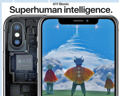
A11 BIONIC CHIP