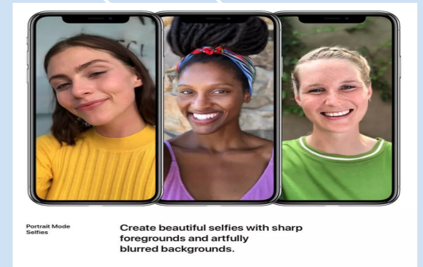
PORTRAIT MODE SELFIE