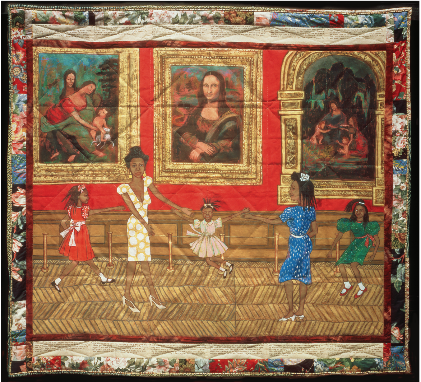
Faith Ringgold © 1991