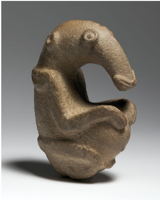
The Ambum Stone