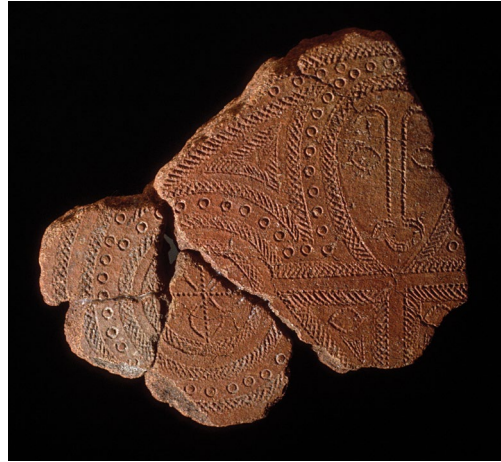
Terra cotta fragment

11. Terra cotta fragment. Lapita. Solomon Islands, Reef Islands. 1000 B.C.E. Terra cotta (incised).