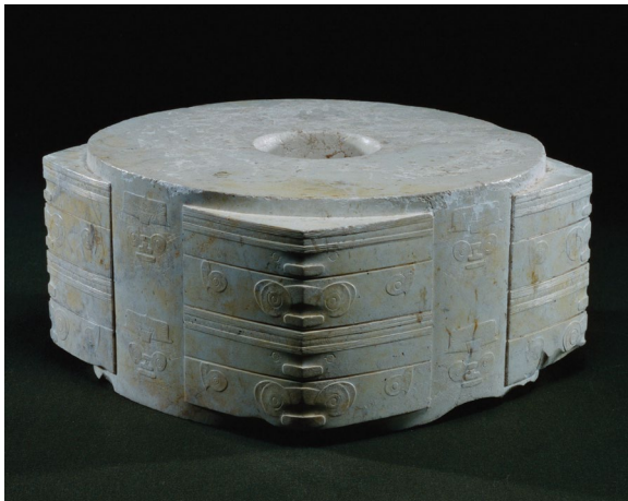
Jade cong