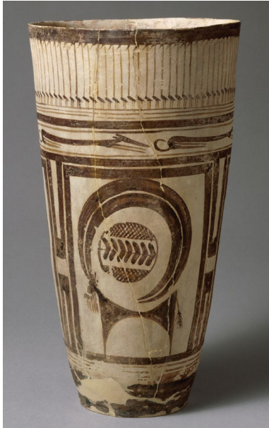
Beaker with ibex motifs