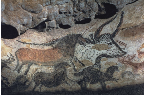
Great Hall of the Bulls

2. Great Hall of the Bulls. Lascaux, France. Paleolithic Europe. 15,000–13,000 B.C.E. Rock painting.