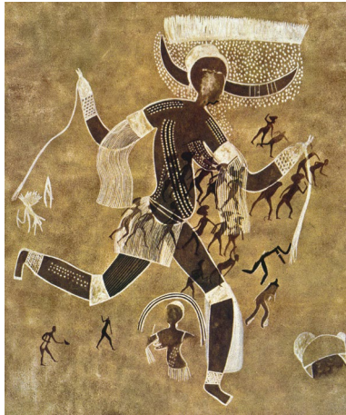
Running horned woman

4. Running horned woman. Tassili n'Ajjer, Algeria. 6000–4000 B.C.E. Pigment on rock.