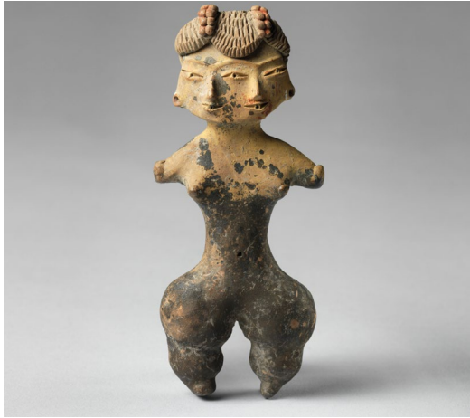
Tlatilco female figurine

10. Tlatilco female figurine. Central Mexico, site of Tlatilco. 1200–900 B.C.E. Ceramic.